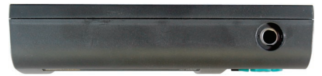
Figure 2. Top Panel

The top panel contains the port for attaching the sensor for Channel 1. An optional extension cable may be used to allow the sensor to be placed in a remote location.