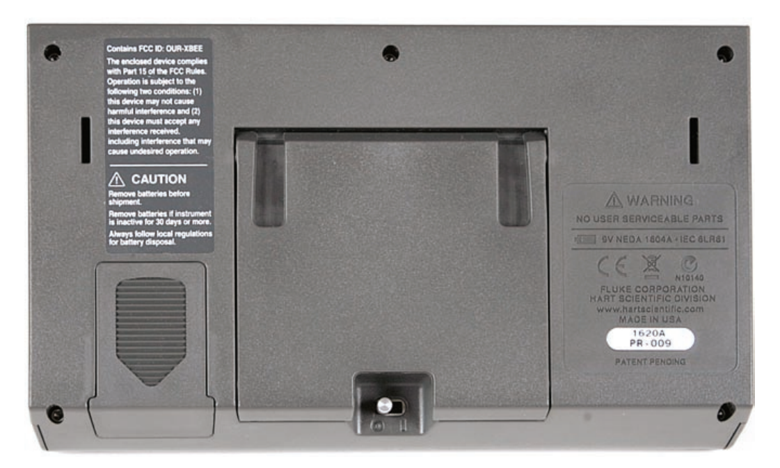
Figure 4. Back Panel

Serial Label - The serial label shows the instrument model and serial number.