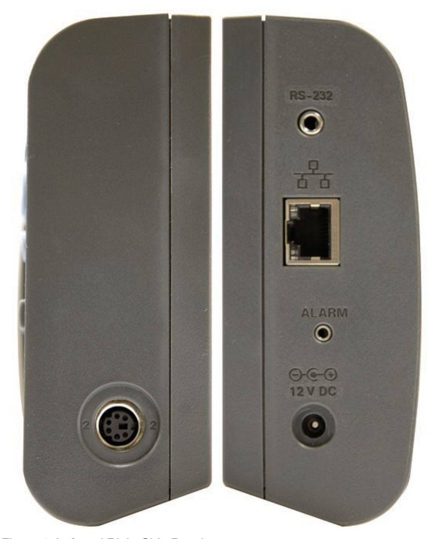
Figure 3. Left and Right Side Panels

DC Power Socket - The DC plug from the AC adapter plugs into the 12V DC power socket to power the instrument. The jack accepts a 5.5 mm miniature power plug (Switchcraft #S760). The outer conductor is ground and the inner conductor is positive. The instrument may draw up to 0.5A.